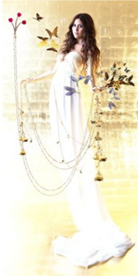
Eliza Doolittle for Alchemy ©